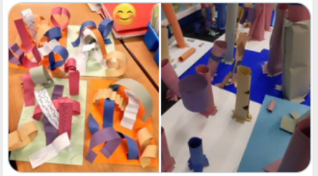
Yr1 artists creating 3D sculptures with paper and card